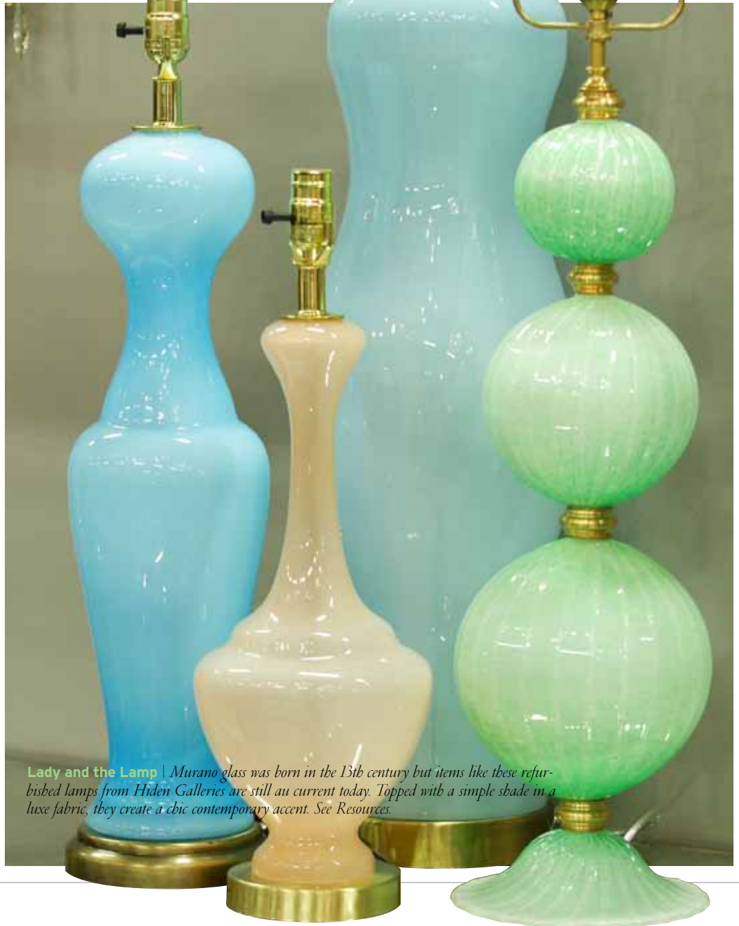
Lady and the Lamp | Murano glass was born in the 13th century but items like these refurbished lamps from Hidden Galleries are still au courant today. Topped with a simple shade in a luxe fabric, they create a chic contemporary accent. See Resources.

would be monochromatic so that the colorful painting and the dresser would be the undeniable focal point," she says. A petite turquoise glass decanter grouped on top of a streamlined white 1960s lacquered chest appeals to her for its simplicity and impact. In a foyer, she would pair the vignette with bold turquoise and white patterned wallpaper. "To create a steady flow in a home, the foyer would be in the same house as the living room with the Hidden Galleries turquoise Murano glass lamps," she says. ●